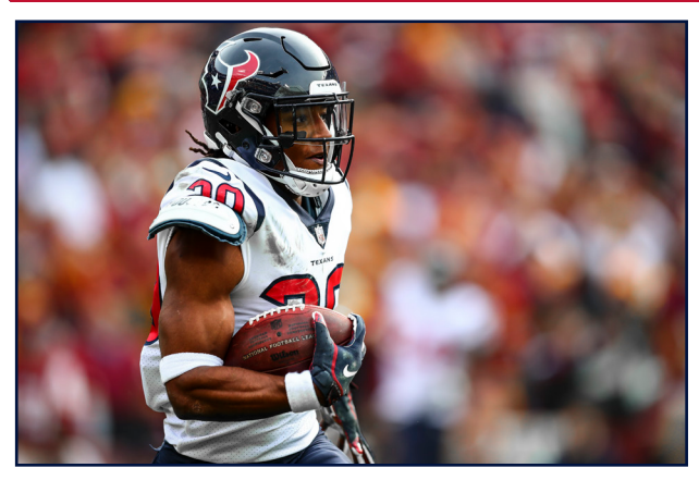
Texans S Justin Reid—a third-round selection in the 2018 NFL Draft—recorded the second-longest interception return for a touchdown in franchise history with a 101-yard interception return at Washington in Week 11. Reid tied for the second-longest interception return for a touchdown by a rookie in NFL history.