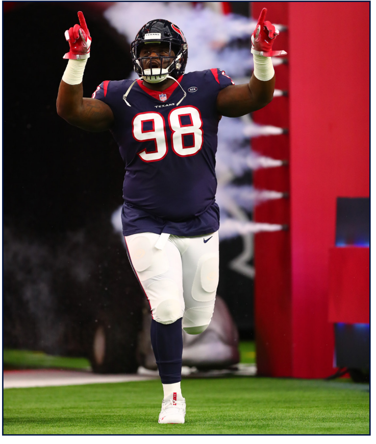
The Texans drafted DE/NT D.J. Reader in the fifth round (166th overall) of the 2016 NFL Draft. Reader has played in 46 games (37 starts) and compiled 102 total tackles (53 solo), 4.0 sacks, 11 quarterback hits, 10 tackles for loss and one pass defensed. Reader has also started three postseason games and recorded 1.0 sack in a Wild Card game against Oakland on Jan. 7, 2017.